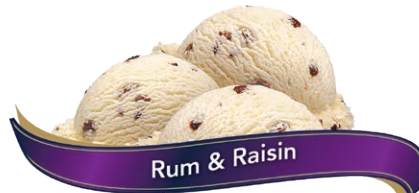
Rum & Raisin

UPC 0 62942 01009 7 SCC 100 62942 01009 4